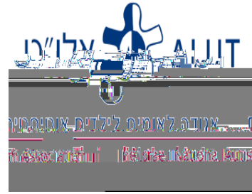
The Israeli National Autism Association

On the occasion of World Autism Awareness Day, the Permanent Mission of Israel cordially invites you to the screening of the film